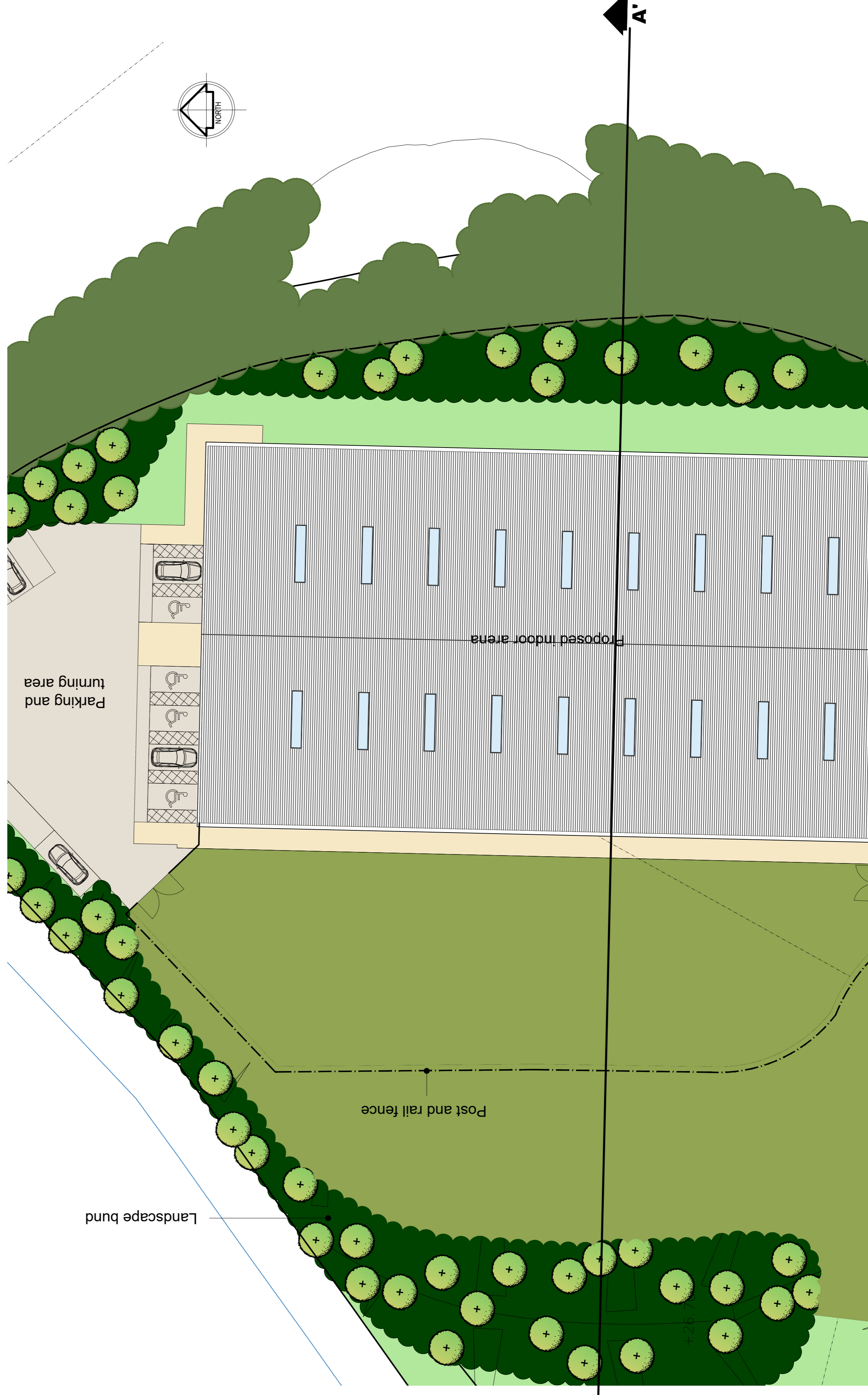
Site plan 1:250